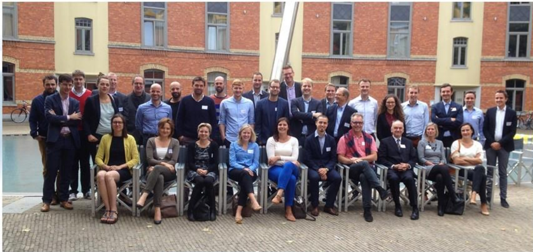
Itinera Summer Seminar 2015